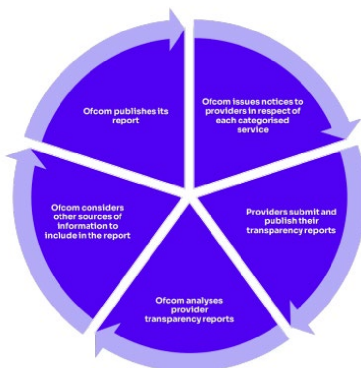
Fig 2. The transparency reporting cycle